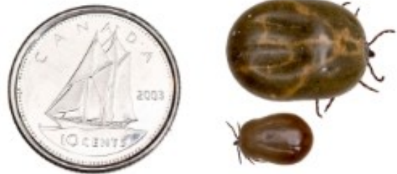
Top to bottom: engorged female dog tick, engorged female black legged tick