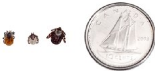
Left to right: Female black legged tick, groundhog tick, dog tick

Ticks are commonly found in tall grass, bushes, wooded areas, urban parks and gardens. There are simple precautions you can take while spending time outdoors.